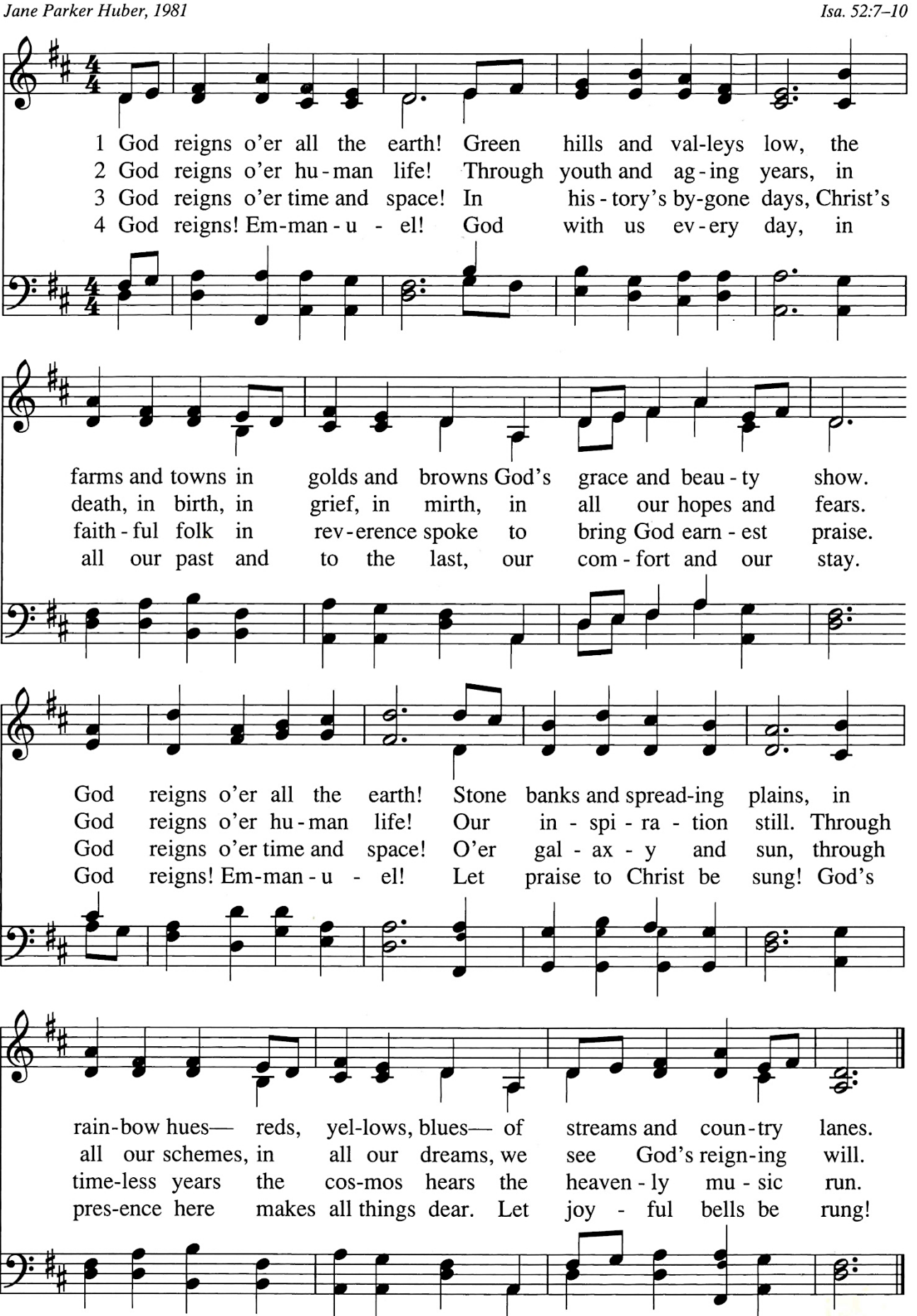
Hymns reproduced by permission under ONE LICENSE #A-723143